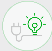
Plug-and-play Installation Saves Time