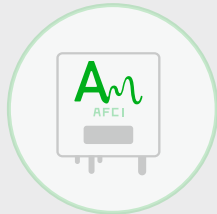
Optional Internal Integrated AFCI Module